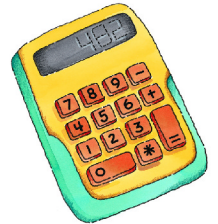
1 (one) calculator